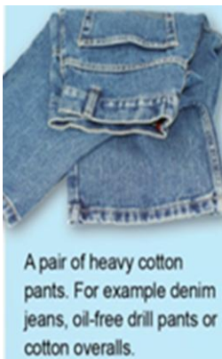
A pair of heavy cotton pants. For example denim jeans, oil-free drill pants or cotton overalls.

Images: Bushfire Survival Plan, Prepare. Act. Survive. (NSW Rural Fire Service) 2013