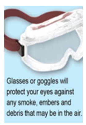
Glasses or goggles will protect your eyes against any smoke, embers and debris that may be in the air.