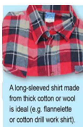
A long-sleeved shirt made from thick cotton or wool is ideal (e.g. flannelette or cotton drill work shirt).