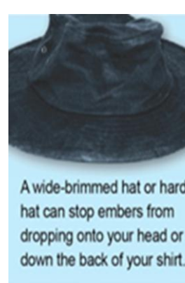
A wide-brimmed hat or hard hat can stop embers from dropping onto your head or down the back of your shirt.